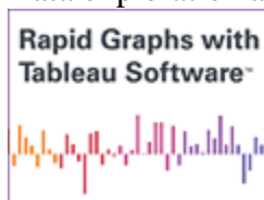
Tableau Training- live, hands-on by author of “Rapid Graphs”. Freakalytics.com

Data exploration and visual analytics in an easy-to-use analysis tool. Tableau Software .