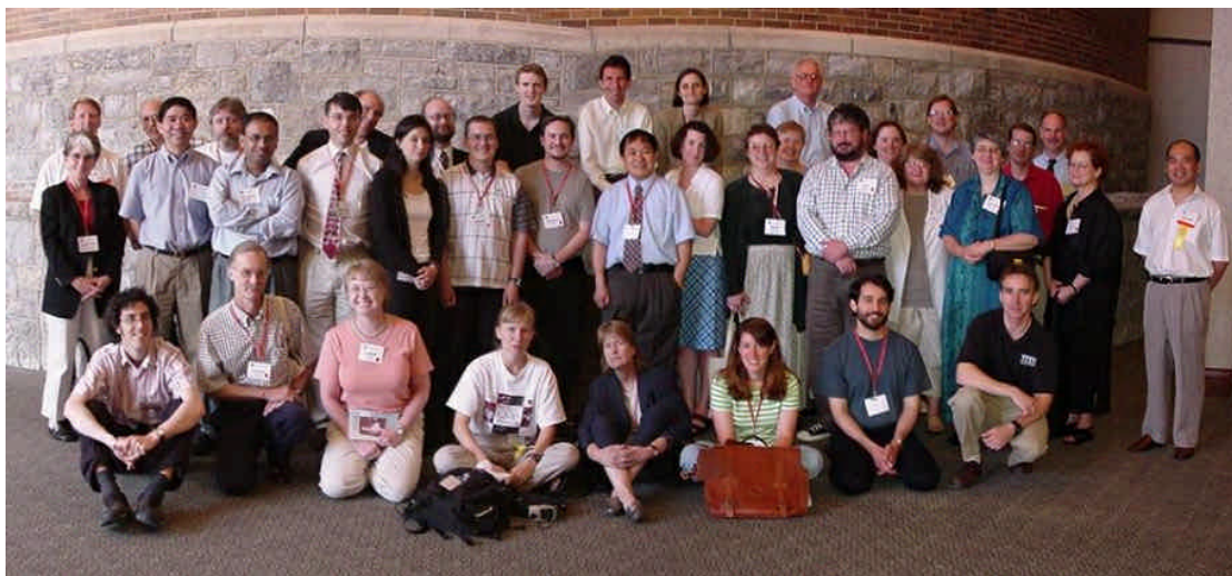
Figure 2: Participants of the workshop.

The first international workshop on "Visual Interfaces to Digital Libraries" was held at the first ACM+IEEE Joint Conference on Digital Libraries in Roanoke, VA, USA on June 28th 2001. The one-day workshop draw an international audience of 37 researchers, practitioners, and graduate students from a range of disciplines, including information visualization, digital libraries, human-computer interaction, library and information science, computer science, and geography.