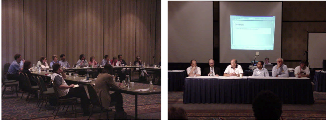
Figure 4: A lively discussion between the audience and the expert panel.