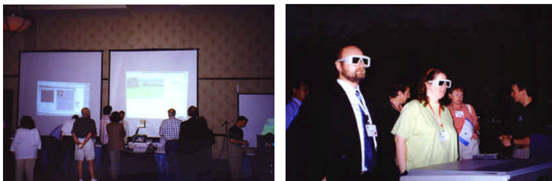
Figure 3: Interactive demo's on large screens. Many participants tasted VRCO's three-dimensional virtual reality system - VGeo for the first time.

Two interactive demonstration sessions included a demo of VRCO's VGeo system and demos from many WS attendees. An expert panel discussed the future of research and development and started formulating top-ten research challenges for visual interfaces to digital libraries to help focus and guide research. In his concluding remark, Chaomei Chen outlined promising areas for future information visualization research, namely, Visual Information Retrieval, Visual Information Exploration, Visual Information Organization, Accommodating Individual Differences, Supporting Collaborative Work, Information Visualization for Bibliometrics, Information Visualization for Scientometrics, Knowledge Tracking, Knowledge Discovery, Designing and Deploying Tangible and Meaningful Visual-Spatial Metaphors in Digital Libraries.