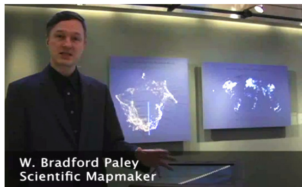
Figure 2: Illuminated diagram display

The map can be explored in a so-called Illuminated Diagram display [Paley 2002] as part of the Places & Spaces: Mapping Science exhibit ( http://scimaps.org/ ). The display combines the incredibly high data density of two large prints: a map of the world and a map of science with the flexibility of an interactive program driving a touch panel display and two projectors that illuminate the maps, see Figure 2 and 1:55 min YouTube video at http://www.youtube.com/watch?v=bXABcOABG4E .